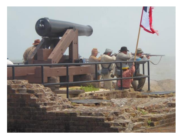
The 3<sup>rd</sup> Miss Inf Co F fires from on top of the wall around the Fort's Cannon at the Federal Attackers.