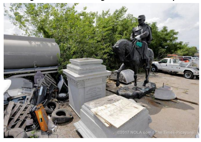
Statues laying on the ground in New Orleans after removal.