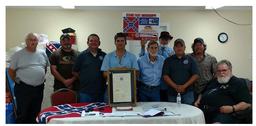
Camp Members and Associates pose for a pic at the April 2017 Meeting woth the newly framed Charter.