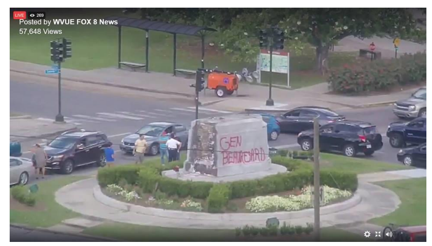
Gen. Beauregard Statue Base after removal.