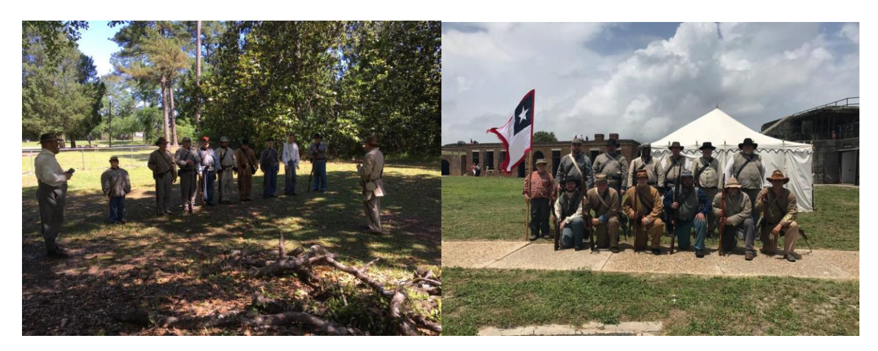
3<sup>rd</sup> Miss Inf drills at Citronelle with Gulf Coast Battalion.

3<sup>rd</sup> Miss Inf at Beauvoir CMD.