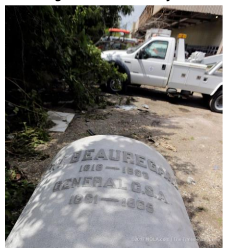
Gen. Beauregard Statue on the ground at Police Impound Yard.